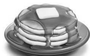
FEBRUARY 25th - 6PM

PASTOR’S CLASSES RESUME starting Wednesday, February 19 at 10 am